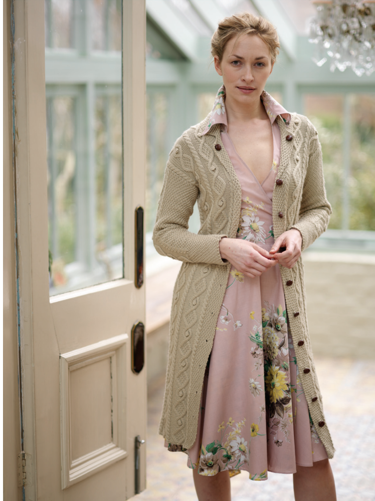
Moss Stitch and Cable Coat designed by Debbie Bliss